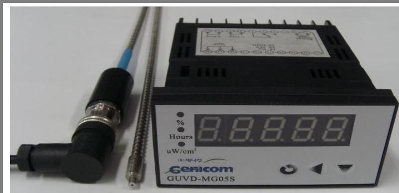
Fig. 1 UV Radiometer 5.0 (Size of Display : 97 × 50 × 112mm 3 )