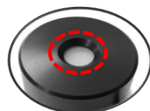
UV Detecting Sensor